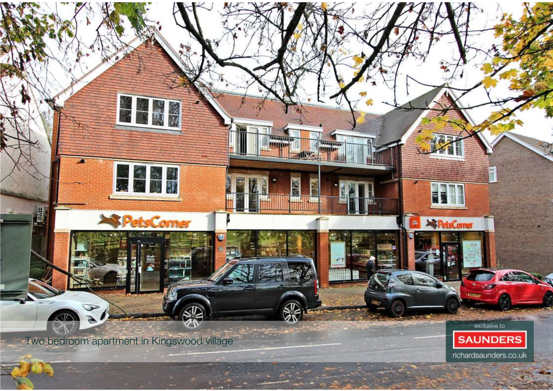
Two bedroom apartment in Kingswood village