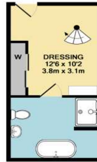
MEZZANINE FLOOR APPROX. FLOOR AREA 212 SQ.FT. (19.7 SQ.M.)