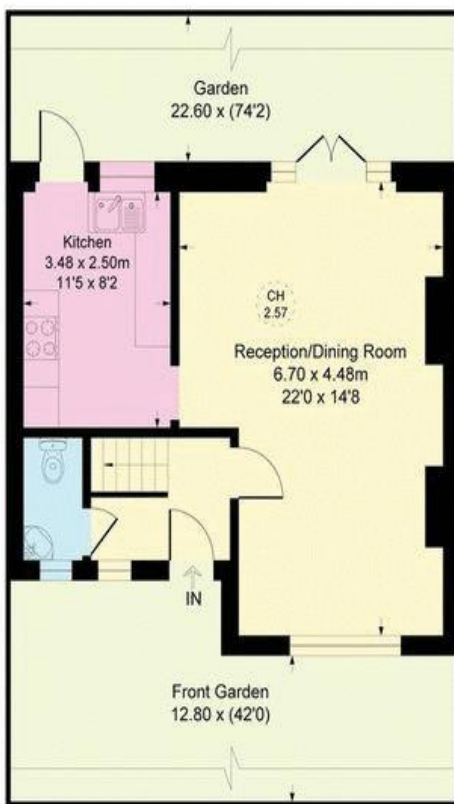
Ground Floor 470 sq ft / 43.7 sq m

Approximate Gross Internal Floor Area = 114.6 sq m / 1234 sq ft