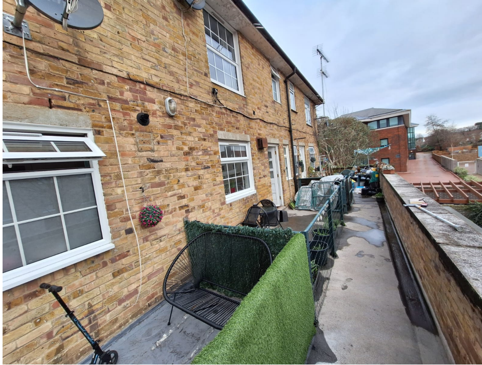
(rear of 62 Portsmouth Road, Cobham)

Costs: Each party bears their own legal fees.