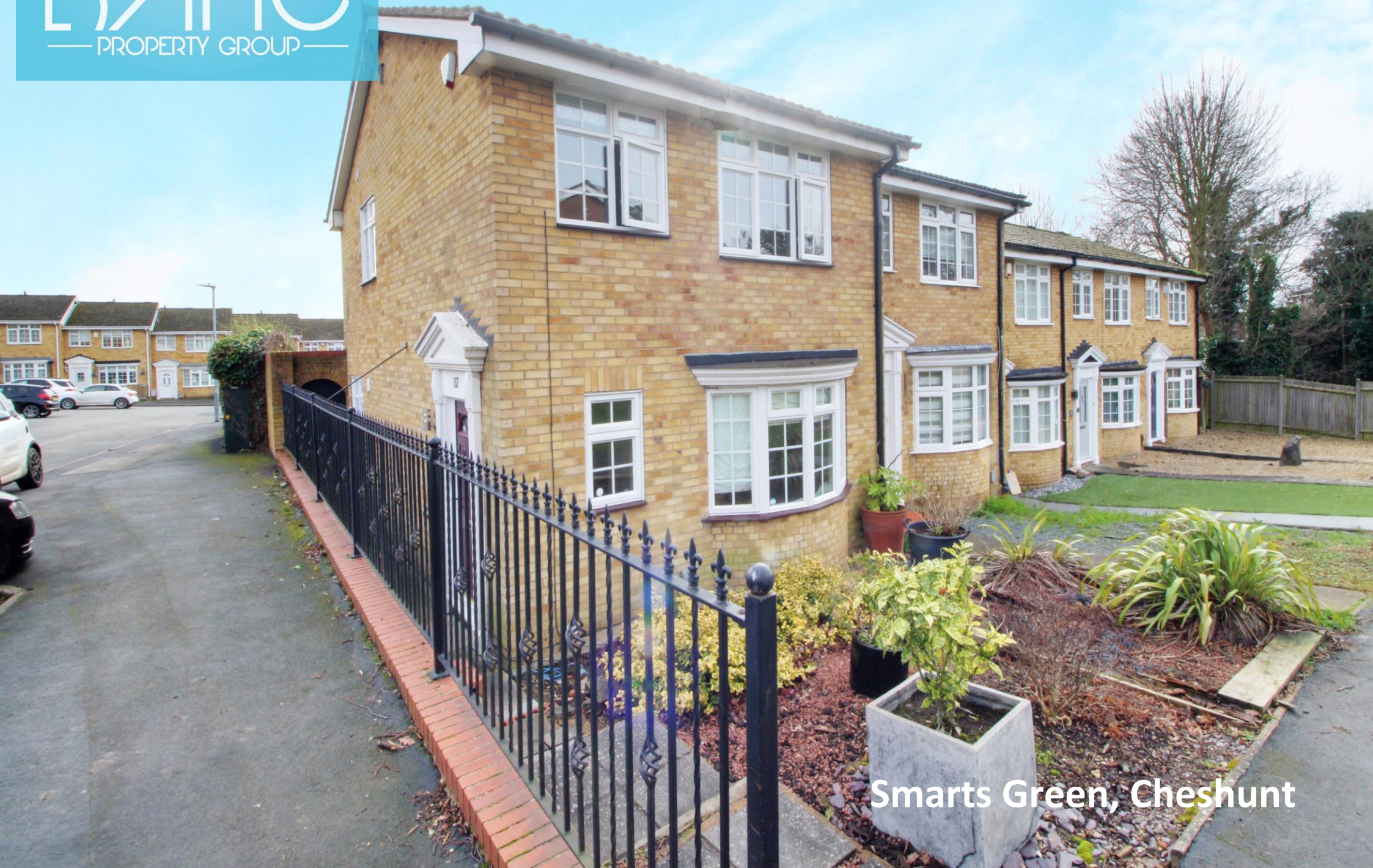
Smarts Green, Cheshunt