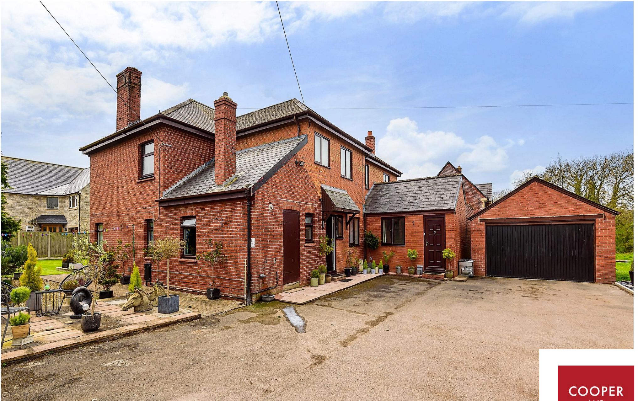
Highgate House, Gate House, Wells, BA5 1UB