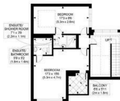
FIRST FLOOR GROSS INTERNAL FLOOR AREA 566 SQFT