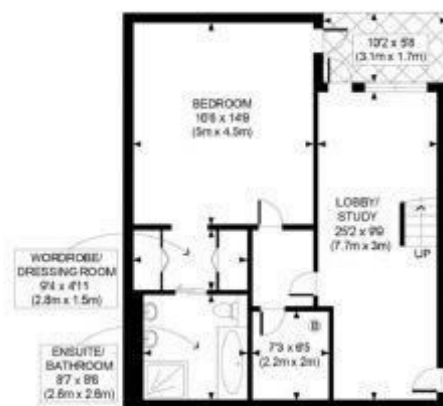
BASEMENT GROSS INTERNAL FLOOR AREA 711 SQFT