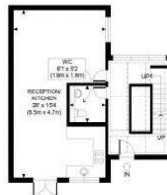
GROUND FLOOR GROSS INTERNAL FLOOR AREA 526 SQFT

APPROX. GROSS INTERNAL FLOOR AREA 1875 SQFT / 174 SQM