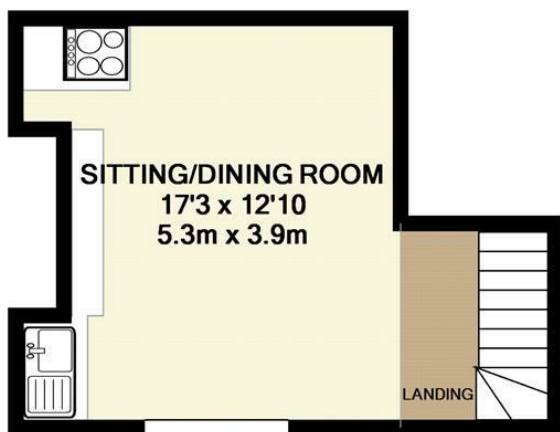
BASEMENT LEVEL APPROX. FLOOR AREA 16.5 SQ.M. (177 SQ.FT.)