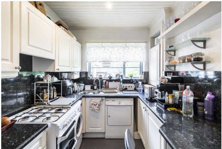
Ossulton Way, Hampstead Garden Suburb, N2 Leasehold £475,000