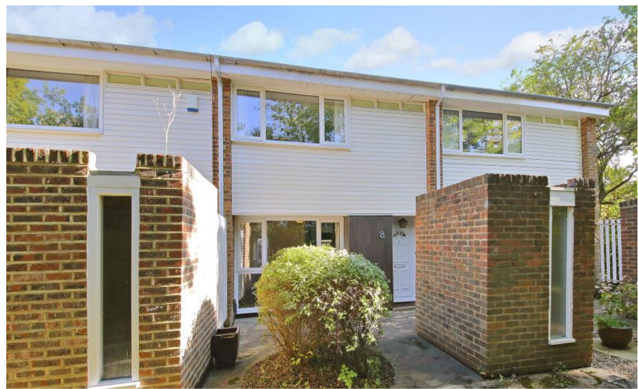
A delightful two bedroom mid terraced house Hawkesworth Close, Northwood, Middlesex HA6 2FT