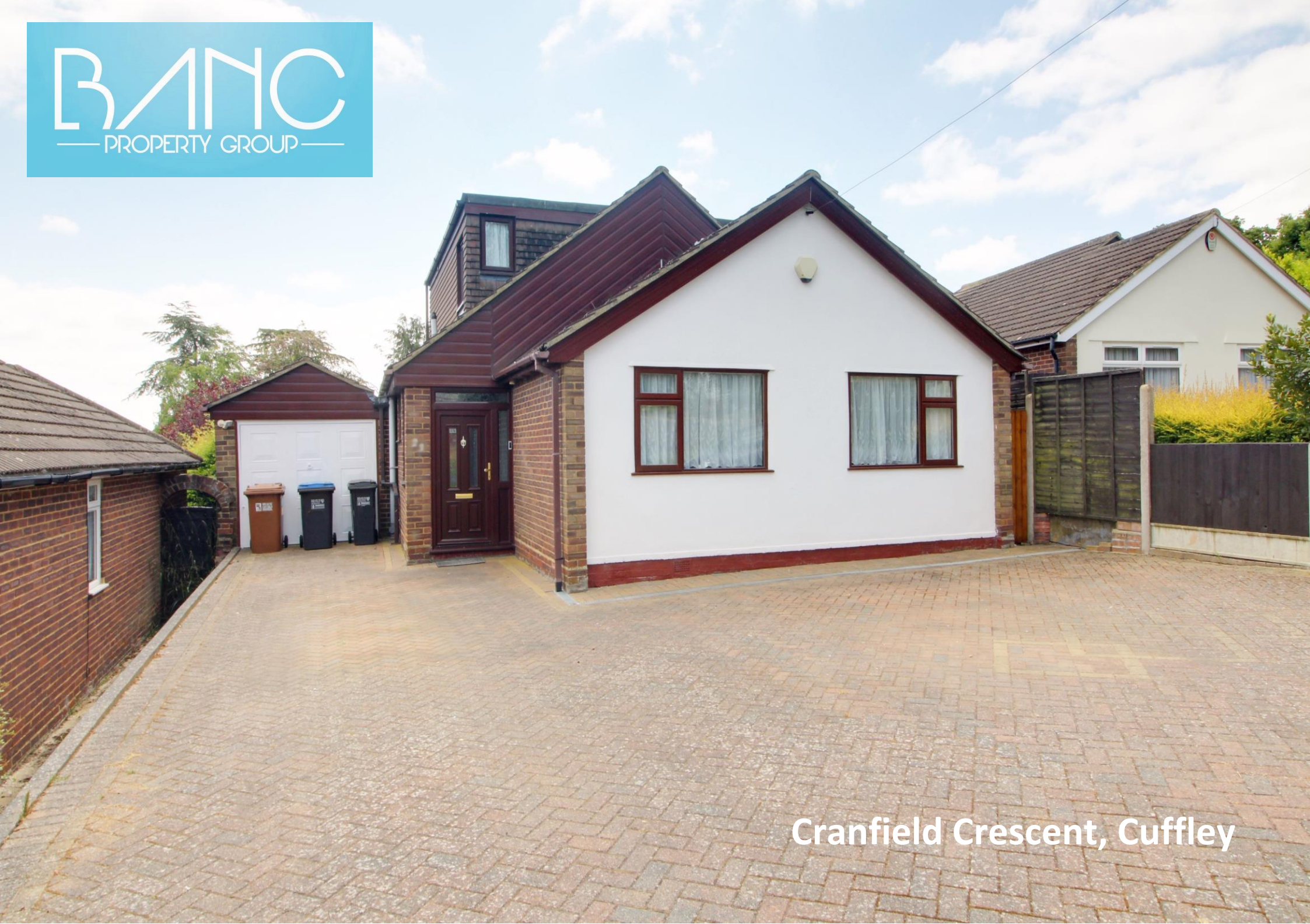
Cranfield Crescent, Cuffley