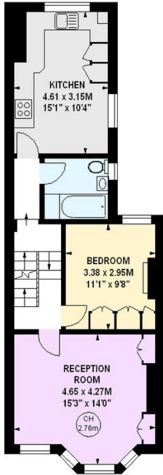
First Floor 596 sq ft