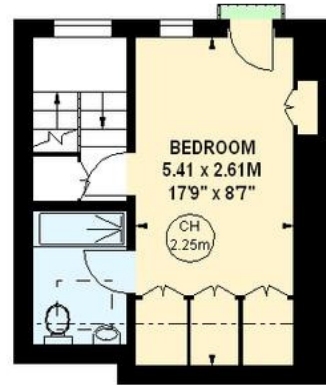
Second Floor 245 sq ft

Illustration For Identification Purposes Only. Not To Scale *Floorplan Drawn According To RICS Guidelines Copyright of FeaturePRO