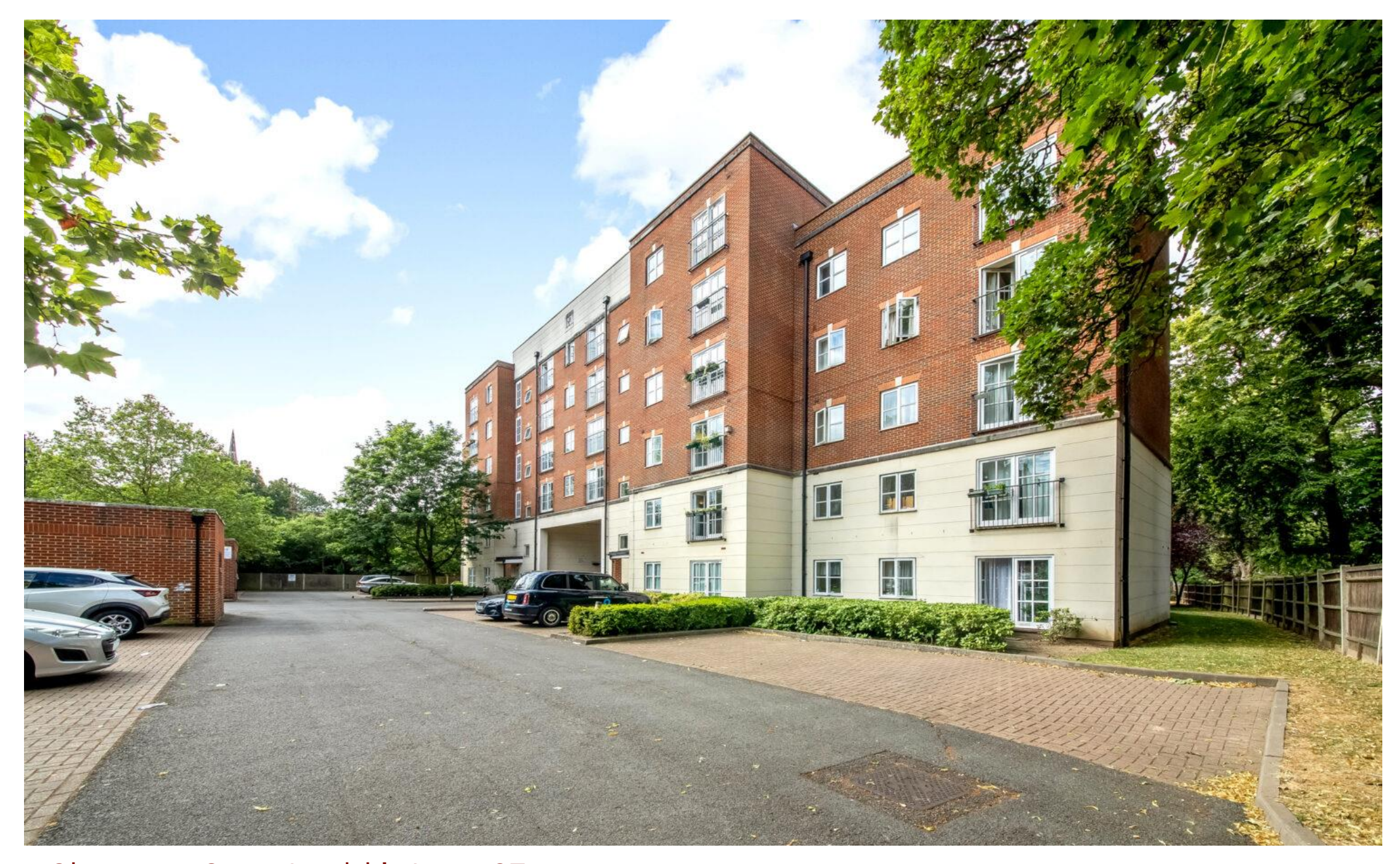
Gloucester Court, Lordship Lane, SE22 OIEO £350,000