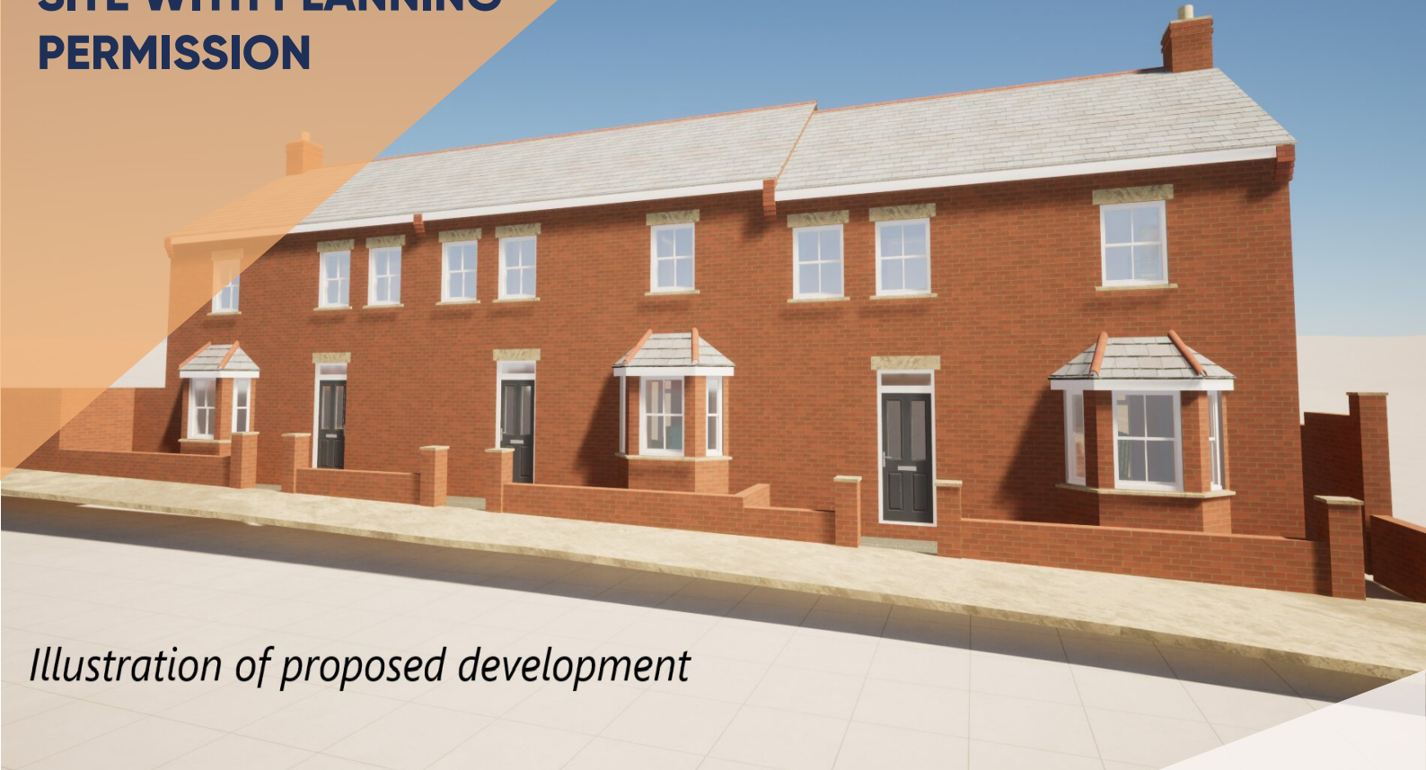
Illustration of proposed development