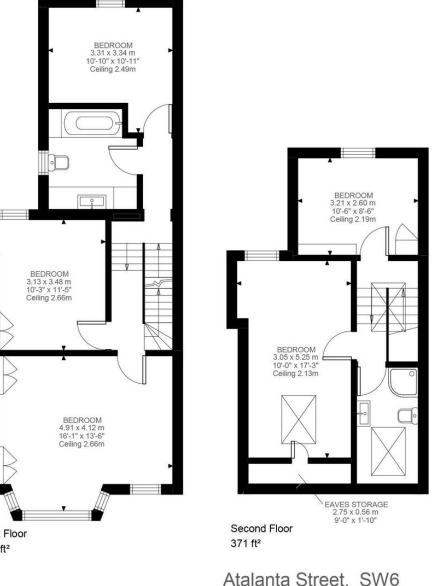
Approximate Gross Internal Area 166.75 SQ.M / 1795 SQ.FT INCLUDING EAVES STORAGE)