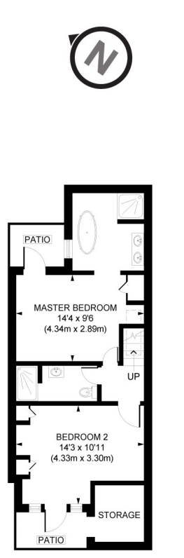
BASEMENT GROSS INTERNAL FLOOR AREA 413 SQ FT