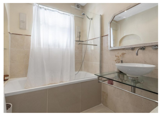
Inglethorpe Street, SW6 £700,000