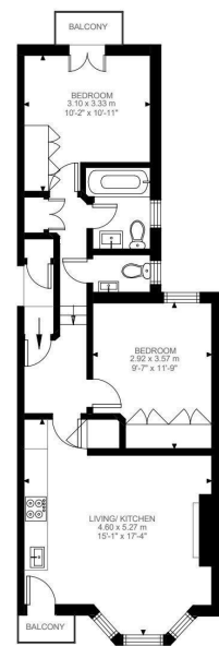
First Floor 566 ft 2

Margravine Gardens, W6 Approximate Gross Internal Area 52.61 SQ.M / 566 SQ.FT