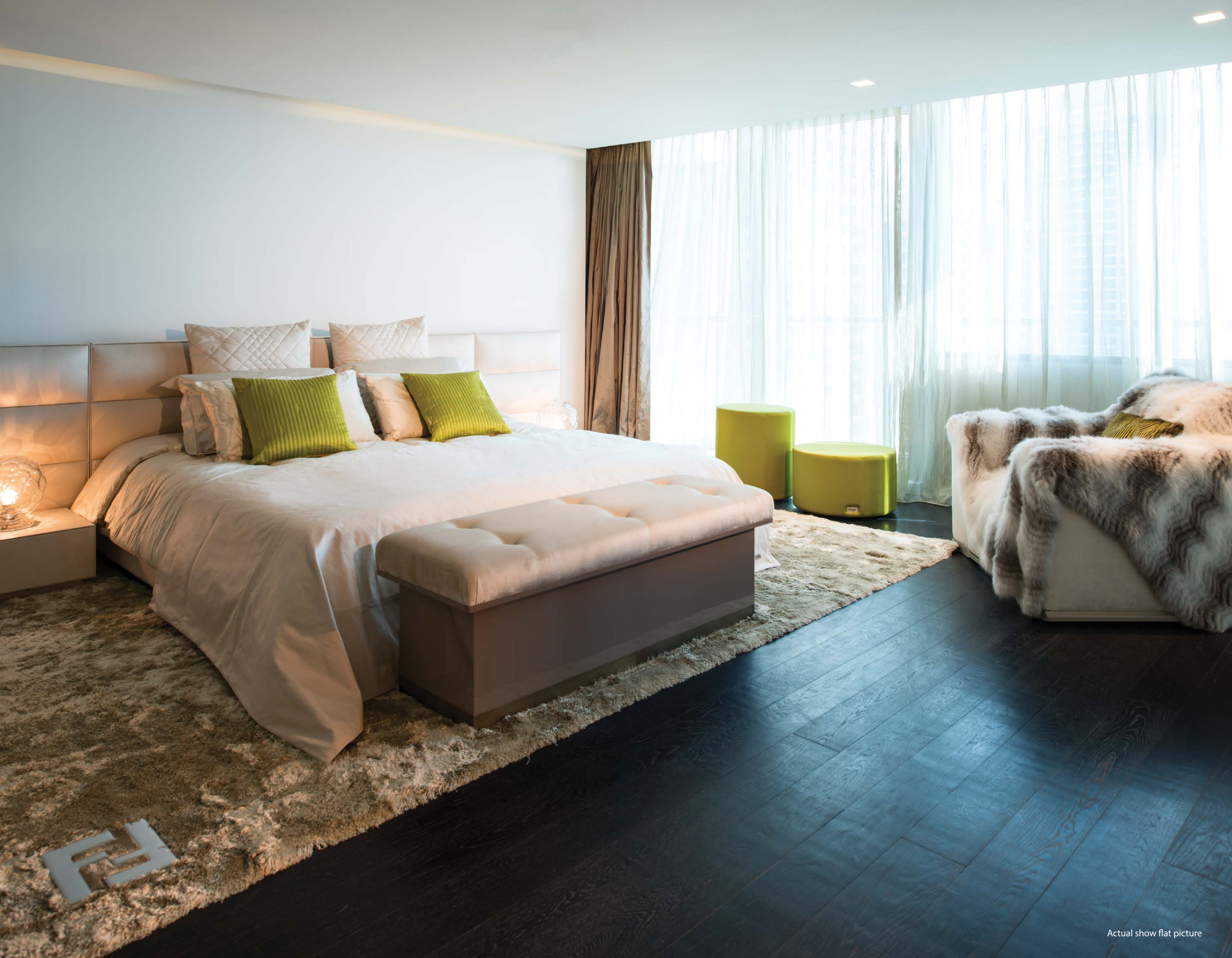
Actual show flat picture