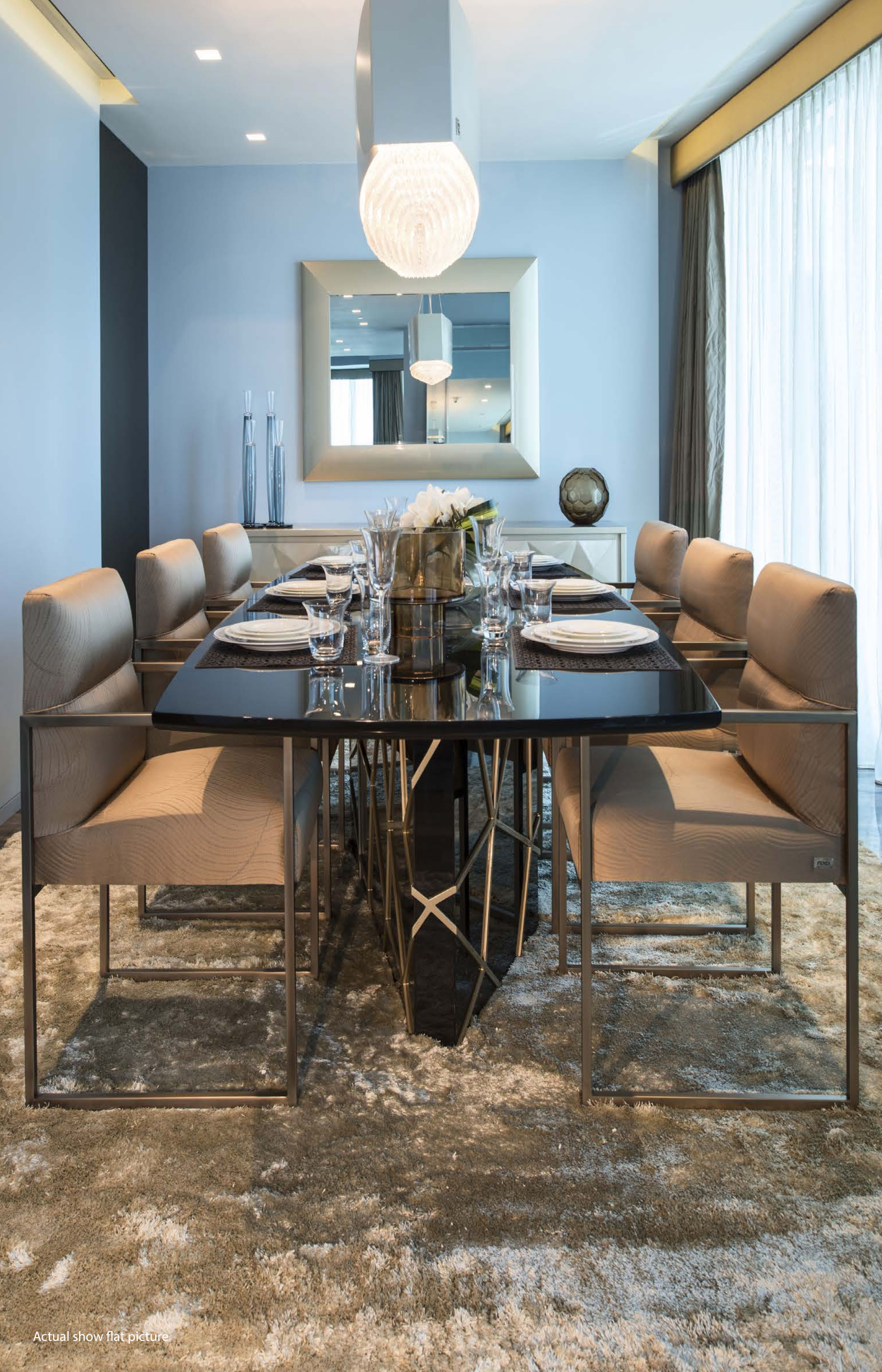
Actual show flat picture