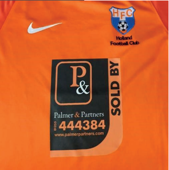
Holland FC Under 8s