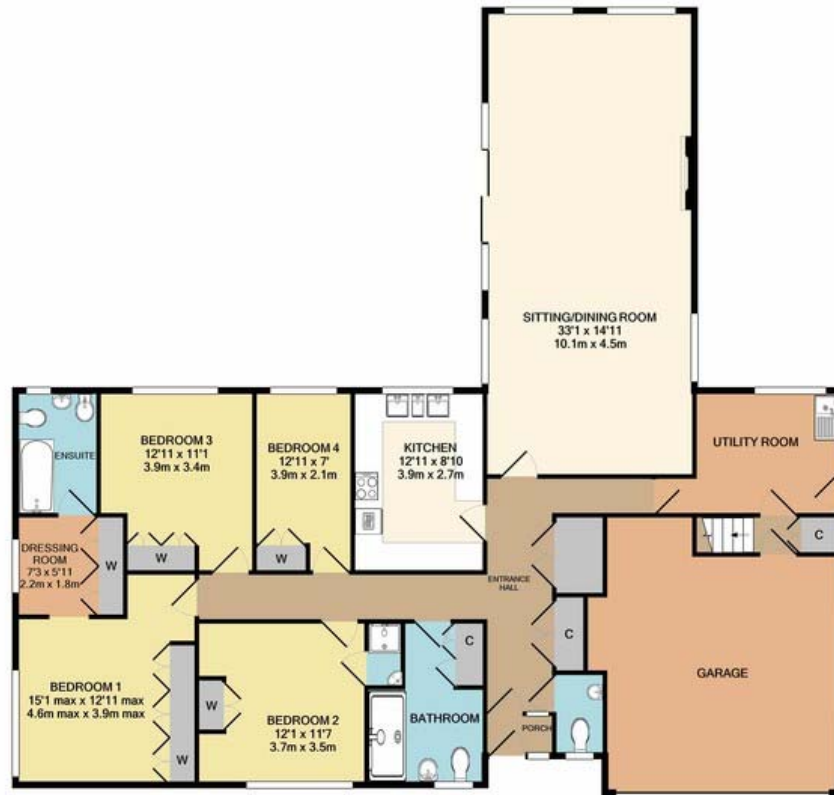
GROUND FLOOR APPROX. FLOOR AREA 2038 SQ.FT. (189.3 SQ.M.)