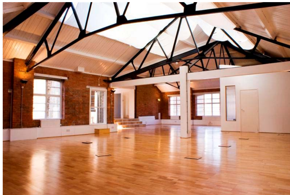
*Image taken prior to current tenants occupation