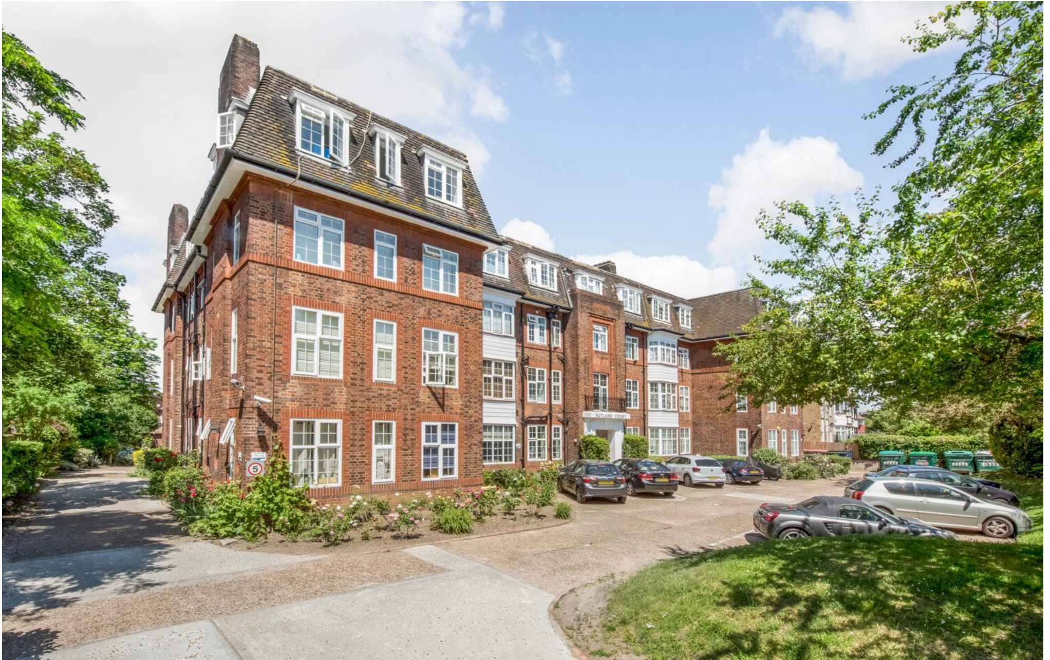
Rutland Court, Denmark Hill SE5 Guide Price £425,000 - £440,000