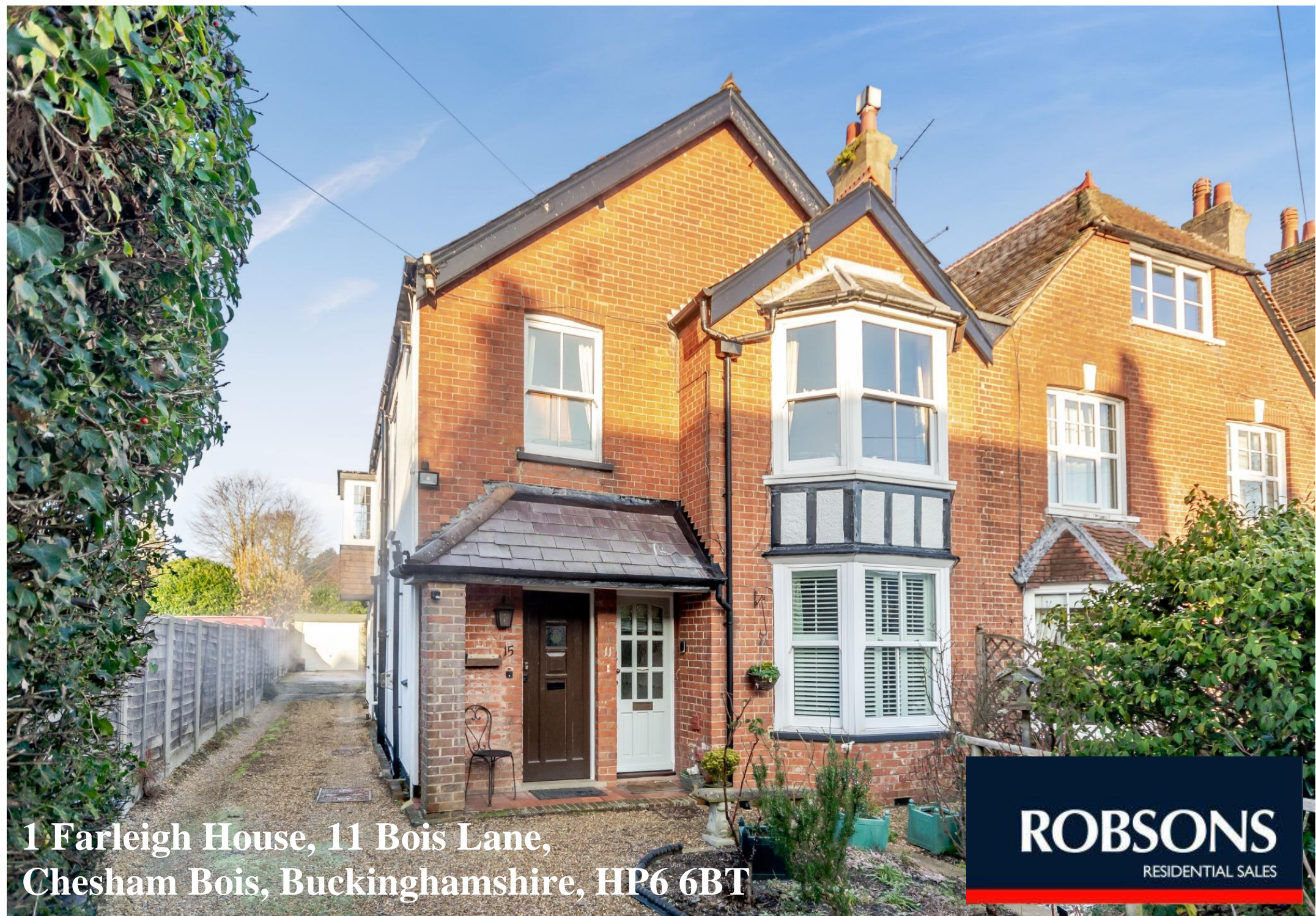
1 Farleigh House, 11 Bois Lane, Chesham Bois, Buckinghamshire, HP6 6BT