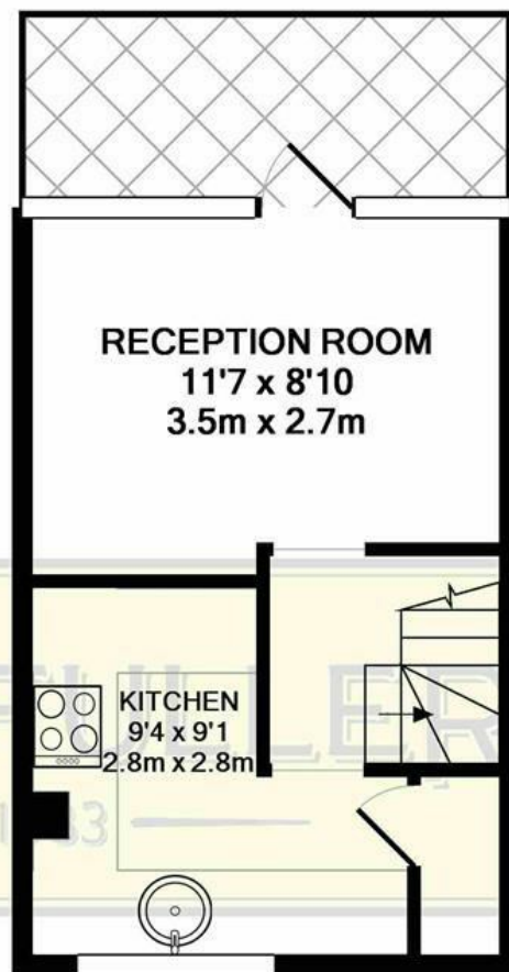
3RD FLOOR APPROX. FLOOR AREA 206 SQ.FT. (19.1 SQ.M.)

KERSFIELD ROAD, SW15 TOTAL APPROX. FLOOR AREA 461 SQ.FT. (42.8 SQ.M.)