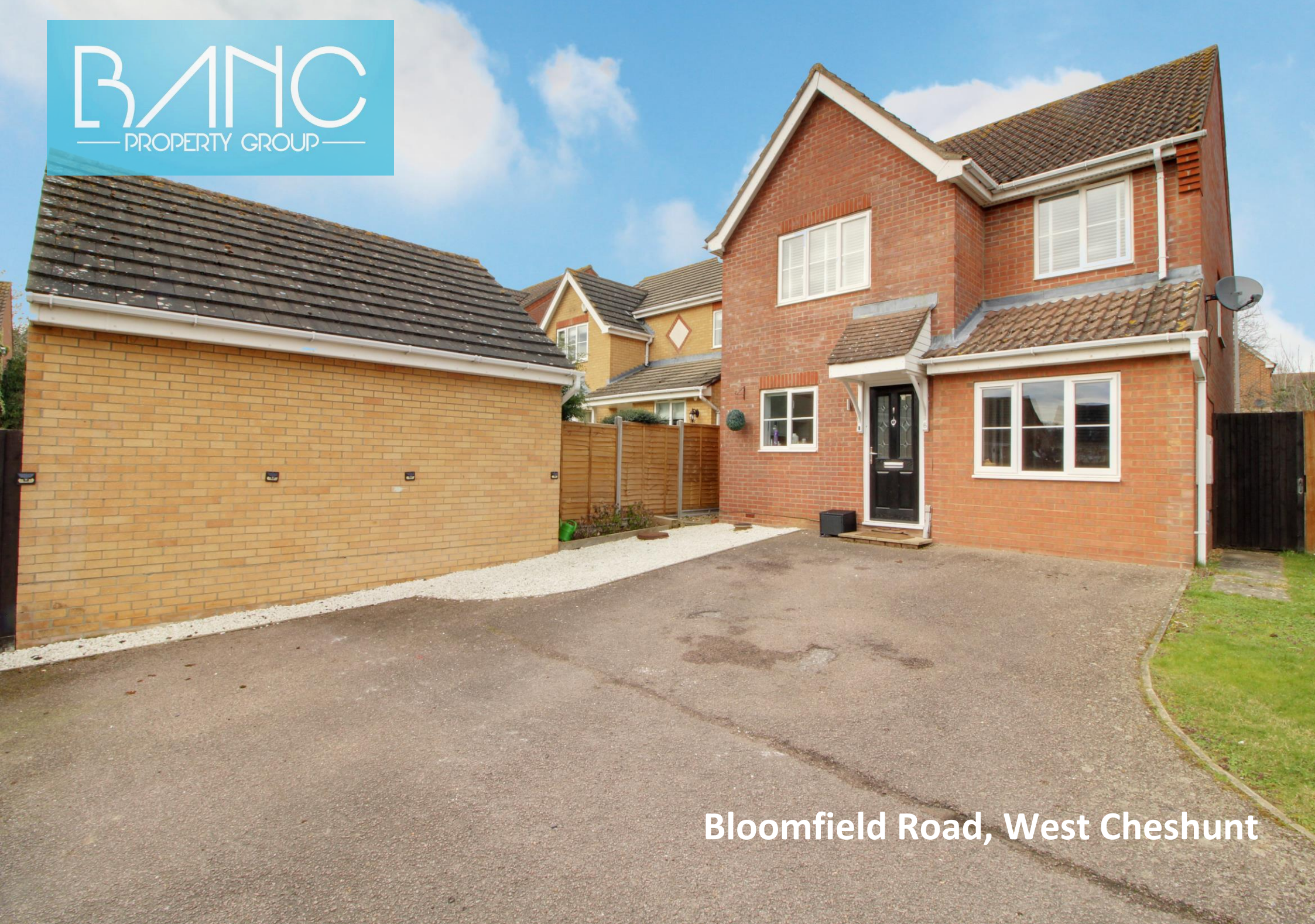
Bloomfield Road, West Cheshunt